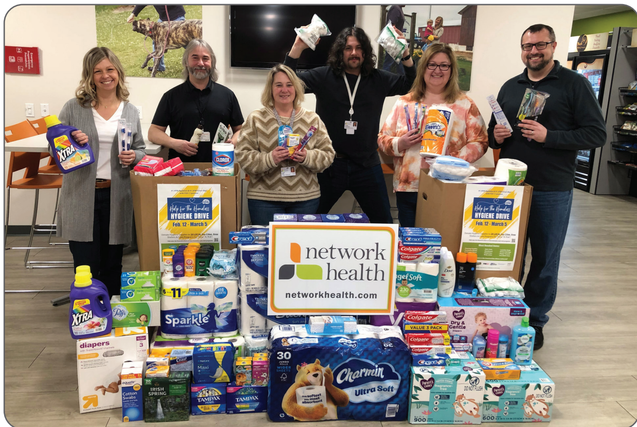
Help for the Homeless Hygiene Drive